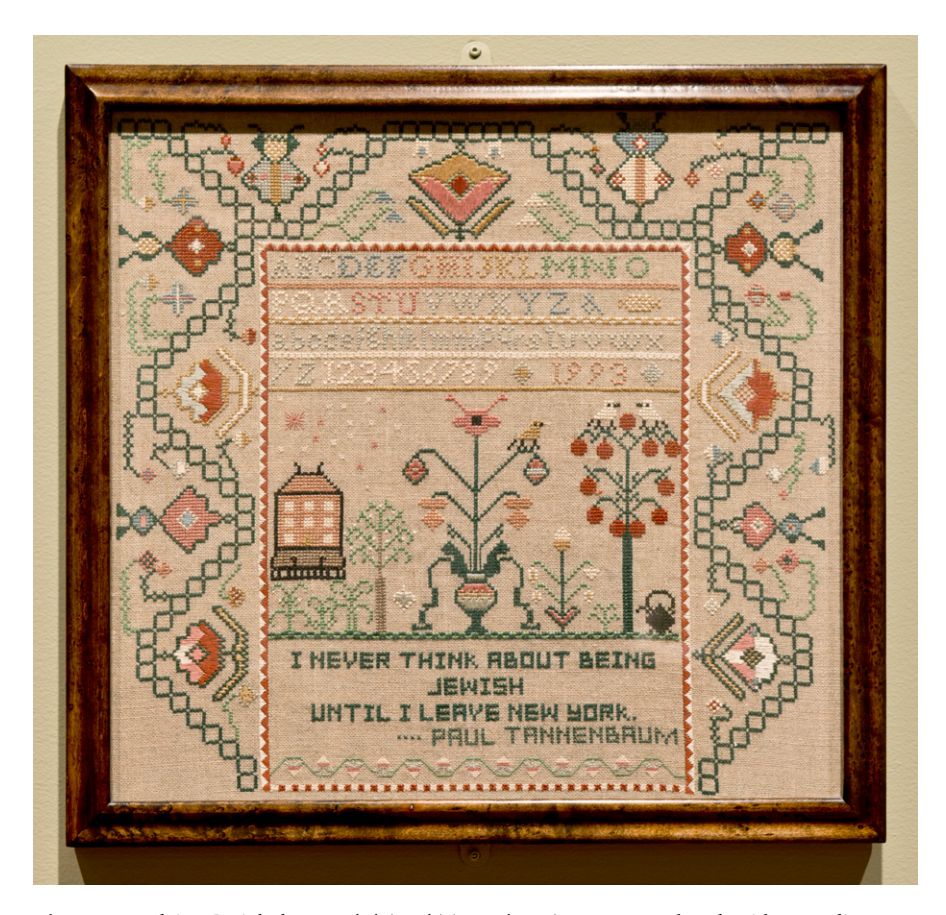
Figure 7 Elaine Reichek, Untitled (Paul Tannenbaum) . 1993. Hand embroidery on linen. 42.5 \times 44.9 cm. Courtesy of the artist.

Not only was the sampler's American history consciously evoked through the installation's title of Reichek's installation, with A Postcolonial Kinderhood Reichek was also able to point to the colonial period's contemporary resonances. When, for example, Reichek relays her brother-in-law's comment that he 'doesn't think about being Jewish until [he] leaves New York' on one sampler (fig. 7), the version of America represented beyond New York in the