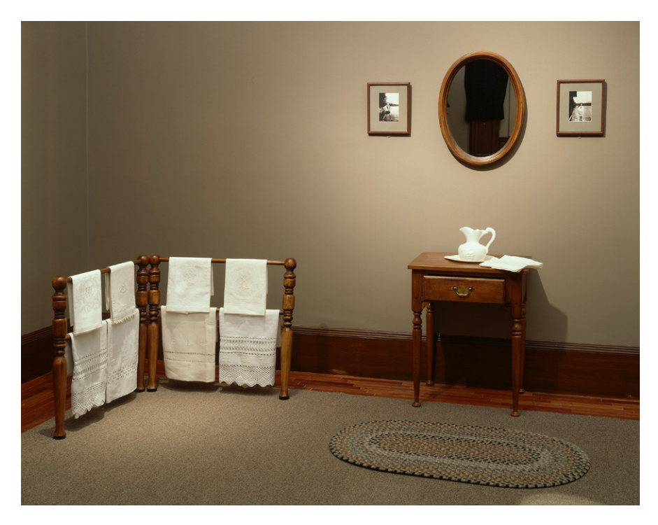
Figure 3 Elaine Reichek, A Postcolonial Kinderhood , 1994. Installation view at the Jewish Museum, New York.

furniture'.<sup>8</sup> But it is not just Reichek's home that is made strange; the 1950s is rendered uncanny through her 1990s interventions. The decade's familiarity – both as the genesis of a certain normative American domesticity and the apex of American modernism – is unsettled in A Postcolonial Kinderhood . In making the 1950s present, Reichek reinscribes the decade with possibility, probing her viewers to consider that the future projected from mid-century might not be the present they were living at century's end.