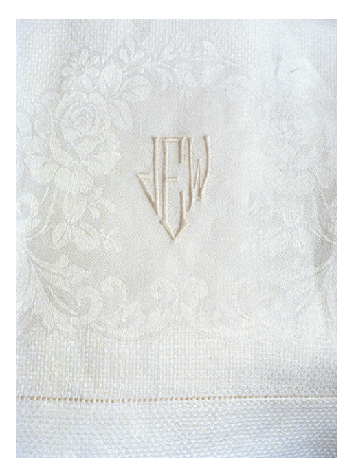
Figure 6 Elaine Reichek, A Postcolonial Kinderhood . 1994. (detail of linen towels).

authority. The tone of the word is unclear, is it accusatory or affirmatory? Does it come from the subject or is it externally imposed? Reichek stages this ambiguity in embroidery, allowing the subject emerging from the text to ricochet between internal and external authorial modes.