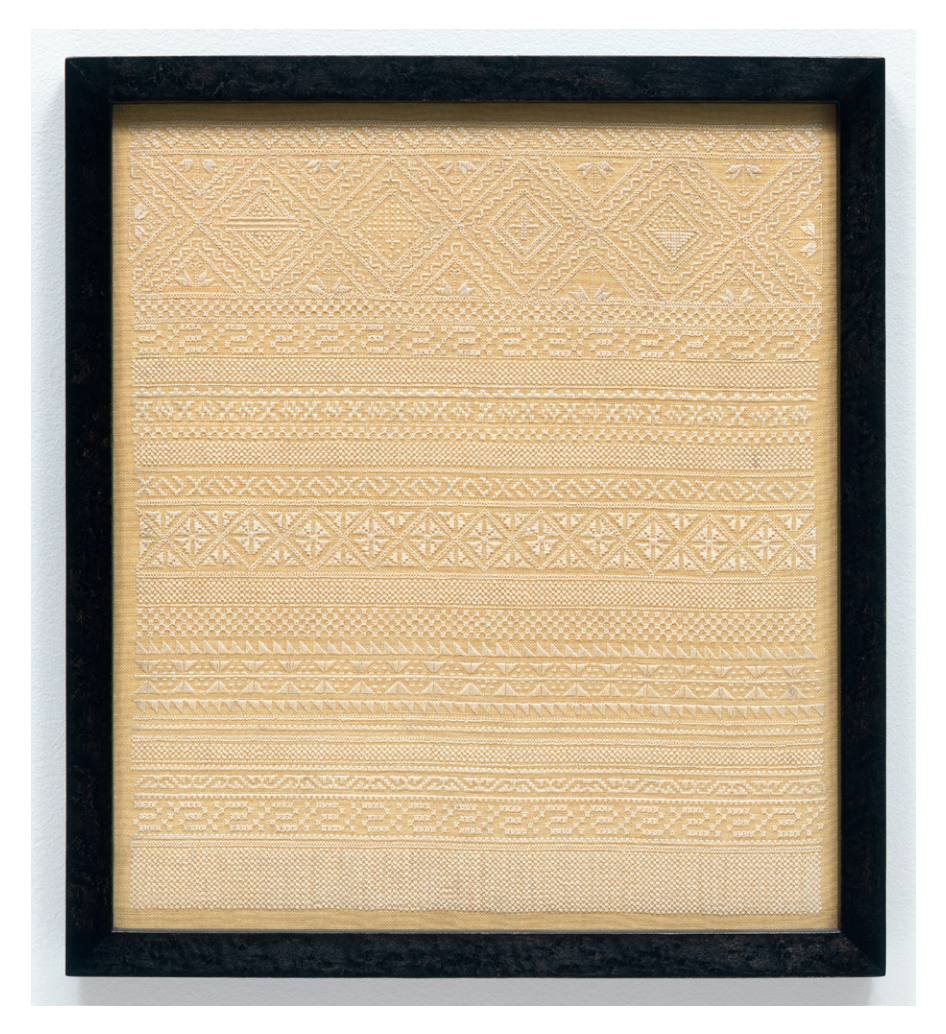
Figure 5 Elaine Reichek, Sampler (White on White) . 1999. Hand embroidery on linen. 46.4 \times 41.3 cm.

can be a little bit pregnant' – was directly copied from an American sampler made by Abigail Gould in 1796. ^{14}