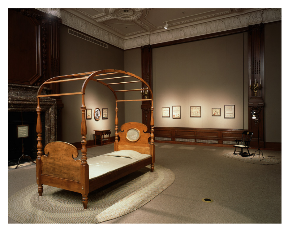
Figure 2 Elaine Reichek, A Postcolonial Kinderhood . 1994. Installation view at the Jewish Museum, New York.

past consciously mediated through the present: the 1950s through the 1990s. This is exemplified by the installation's eleven textile pieces: relaying quotes Reichek collected from family and friends in 1993 (including the Frankel sampler); these works provide entry points into the past while simultaneously affirming the installation's present. The same logic guides the selection and arrangement of furniture in the installation. Ordered from the same company her parents used to decorate their home, Reichek altered each piece to make it smaller, and then dispersed the furniture in a dimly lit room much larger than her childhood bedroom. These games of scale are deftly deployed to point to a past at once temptingly close and at a remove.