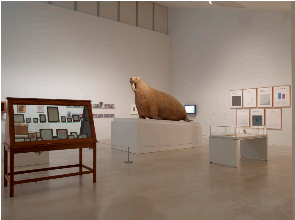
Fig. 3: View of installation.