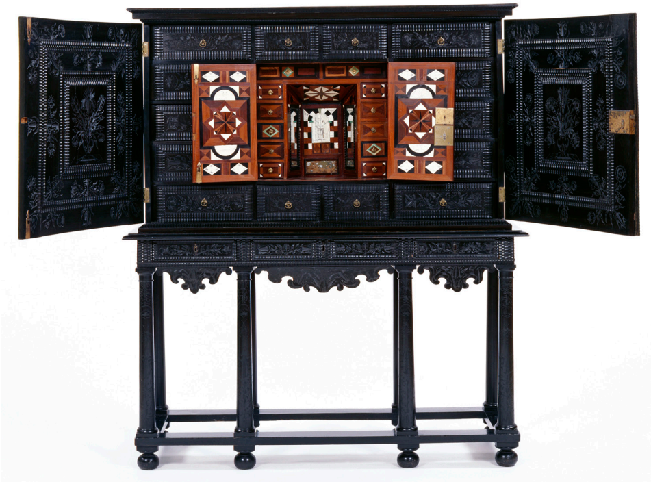
Fig. 2: Cabinet by John Evelyn.