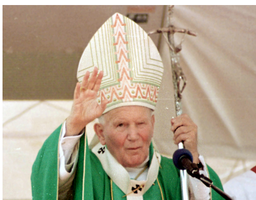
Figure 1. High-profile Parkinson’s patients such as Pope John Paul II have raised the awareness of the disease in the public consciousness.

The profile of Parkinson’s disease in the public eye has been raised significantly over the last twenty years, with several highly visible figures such as Michael J Fox, Janet Reno and Pope John Paul II being diagnosed with the disorder (Figure 1).