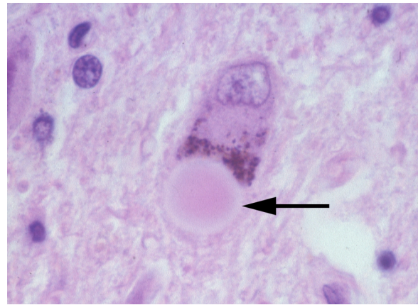
Figure 3. Lewy bodies in the midbrain. A lewy body in a melanised neuron from the substantia nigra. The lewy body is the spherical body indicated by an arrow.

Perhaps the single largest contribution to our understanding of PD has been the identification of genetic mutations in individuals with familial and sporadic forms of the disease - discoveries in which the Institute of Neurology has played a key role. In 1997, a single base pair mutation in the DNA of the \alpha -synuclein gene was found in a Greek and Italian family (for a description of how these mutations can disrupt cells and cause disease, see Figure 2). This causes a change in the structure of the \alpha -synuclein protein that is thought to increase the propensity of \alpha -synuclein to aggregate (Conway, 1998). The importance of \alpha -synuclein was further underlined by the discovery in the laboratory of John Hardy, now a professor at the Institute of Neurology, of a triplication of the gene in the genome, which is thought to result in a doubling of the normal amount of protein being made (Singleton, 2003). When viewed under a microscope, the substantia nigra and areas of the cortex show insoluble lumps of this protein in inclusion bodies, which are thought to sequester aggregated proteins in the cell, possibly in an attempt to reduce the toxic effects of this aggregation. These inclusions are referred to as Lewy bodies, after Frederick Lewy who was the first to describe them in 1912 (Figure 3) (Lewy, 1913).