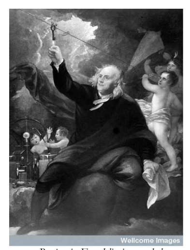
Benjamin Franklin invented the lightning rod.