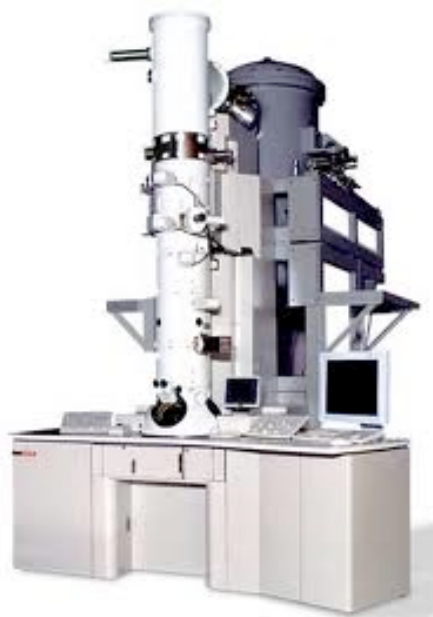
Figure 2. Example of a typical TEM with voltage of 200 kV.

In the meantime, mathematicians since the 1980s have been developing the field of discrete tomography. Beginning from a few 2-D projections, it aims to reconstruct 3-D images by processing them in thousands of units (pixels) and using iterative binary algorithms, in which only values of either 0 or 1 are assigned to each pixel (Batenburg 2006). The more complex the image, the more accurate and fast the reconstruction. In the case of very complex images, the accuracy strongly depends on the number of projections used. A fundamental procedure for the 3-D image reconstruction is the recording of a series of projections of the sample at different orientations. This is achieved by tilting the sample at a range of angles. This is still limited and it can generate the so called ‘missing edge’ artefact which is essentially a lack of information at the edges of the sample. This problem can be overcome by tilting the sample along two axes. Furthermore the use of mathematical algorithms which combine continuous and discrete 3-D binary reconstructions can help in recovering the loss of information due to the “missing edge”. In the last 20 years mathematicians and material scientists have joined forces to produce 3-D images of objects in the nanoworld, demonstrating success in reconstructing 3-D images of gold nanoparticles, magnetotactic bacteria, porous environment in zeolites, but none of the 3-D images had ever reached the atomic resolution.