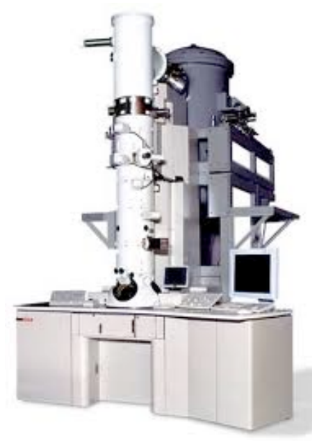
Figure 2. Example of a typical TEM with voltage of 200 kV.

In the meantime, mathematicians since the 1980s have been developing the field of discrete tomography. Beginning from a few 2-D projections, it aims to reconstruct 3-D images by processing them in thousands of units (pixels) and using iterative binary algorithms, in which only values of either 0 or 1 are assigned to each pixel (Batenburg 2006). The more complex the image, the more accurate and fast the reconstruction. In the case of very complex images, the accuracy strongly depends on the number of projections used. A fundamental procedure for the 3-D image reconstruction is the recording of a series of projections of the sample at different orientations. This is achieved by tilting the sample at a range of angles. This is still limited and it can generate the so called 'missing edge' artefact which is essentially a lack of information at the edges of the sample. This problem can be overcome by tilting the sample along two axes. Furthermore the use of mathematical algorithms which combine continuous and discrete 3-D binary reconstructions can help in recovering the loss of information due to the "missing edge". In the last 20 years mathematicians and material scientists have joined forces to produce 3-D images of objects in the nanoworld, demonstrating success in reconstructing 3-D images of gold nanoparticles, magnetotactic bacteria, porous environment in zeolites, but none of the 3-D images had ever reached the atomic resolution.