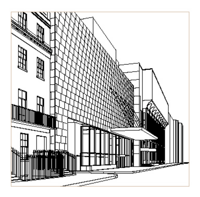
Figure 1. The new Institute for Cultural Heritage as planned to occupy the now cleared Gordon Street site (the image is from the Institute's UCL web site: http://www.ucl.ac.uk/ifch/building).