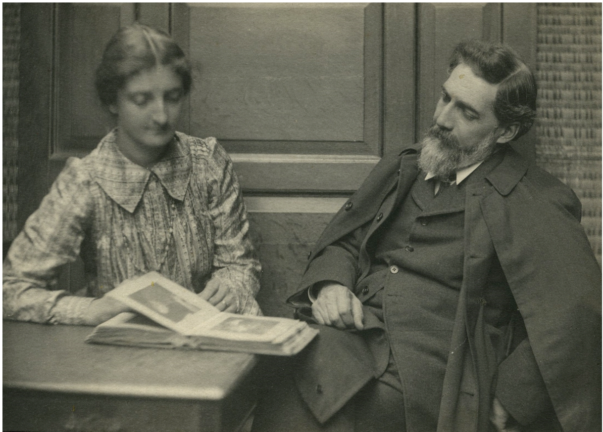
Figure 6: Hilda and Flinders Petrie in 1903

excavations for the remainder of his life (Janssen 1992: 8). The Petries worked as a team on their excavations until Flinders' death in 1942 and Hilda became an archaeologist in her own right, working on-site in Egypt and later in Palestine with her husband (Sparks 2013, Figure 6 ). Among myriad other tasks, Hilda worked as a skilled excavator, archaeological illustrator and administrator in the field (Drower 1985: 243). She also managed the project finances and the promotion of Flinders' work, which was vital in keeping their archaeological projects afloat (Sparks 2013: 1). Indeed, in the dedication to his autobiography, Flinders declared that it was 'on [Hilda's] toil that most of my work has depended' (Petrie 1931).