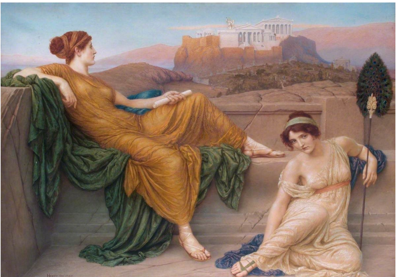
Figure 4: Aspasia on the Pnyx by Henry Holiday, oil on canvas, 1888. Camden Local Studies and Archives Centre, no. 086534

Holiday's works can be seen across the UK and beyond: from his drawings and paintings in the British Museum to his stained glass windows throughout Cumbria and Wales. iv His oil painting Dante and Beatrice (1883) v , now on display in the Walker Art Gallery, Liverpool, is widely regarded as his most celebrated work. However, his oil-on-canvas Aspasia on the Pnyx (1888, Figure 4 ) should also be considered as one of his most important artistic productions.