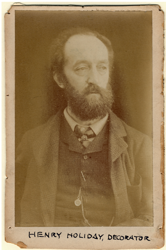
Figure 2: Henry Holiday, unknown photographer, albumen print, 1870s. NPG x18530 (courtesy of the National Portrait Gallery)