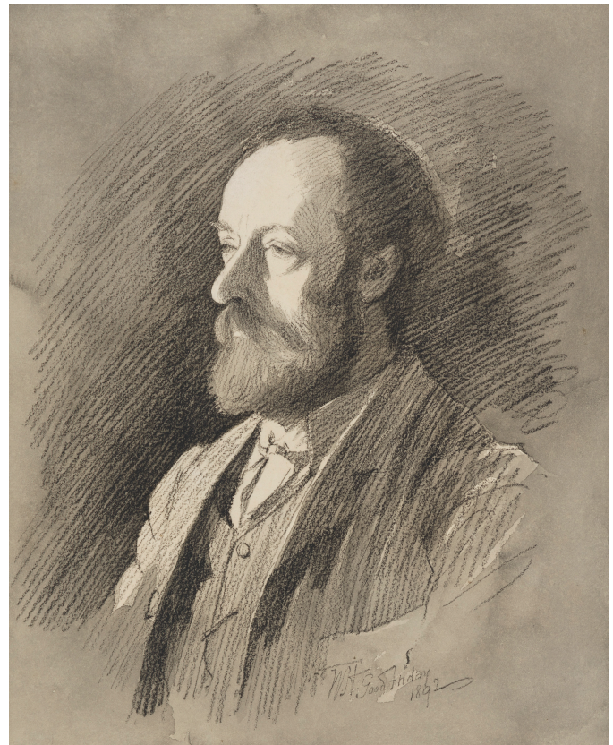
Figure 3: Henry Holiday by (William) Walker Hodgson (1864-active 1923), monochrome ink wash over pencil on artboard, 1892. NPG 7085