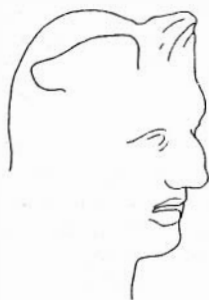
Fig. 3. Head of a Charun