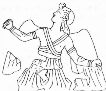
Fig. 2. Image of a vanth