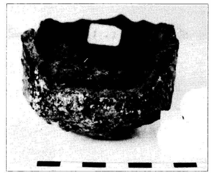
Figure 3 Lid fragment of broken wootz crucible.