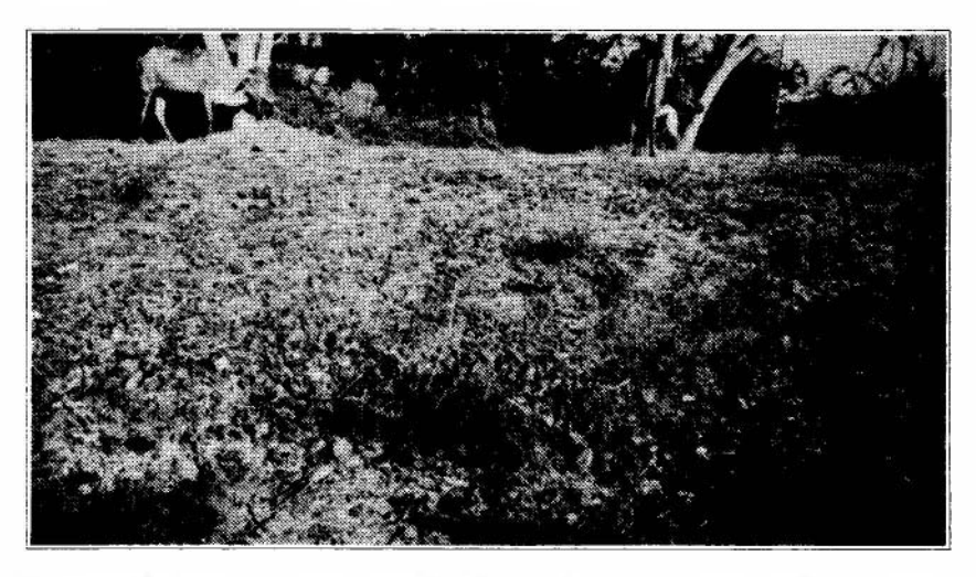
Figure 2 Mound near Mel-siruvalur village, South Arcot district, Tamil Nadu.

S. Patil as being of the late medieval period (c. sixteenth century AD). Several hollow conical terracotta jars about 70cm long of indeterminate function were also found stacked along the walls of the canal. Without more detailed survey and investigations, the possibility of these pottery assemblages being related to the metallurgical activity cannot be confirmed.