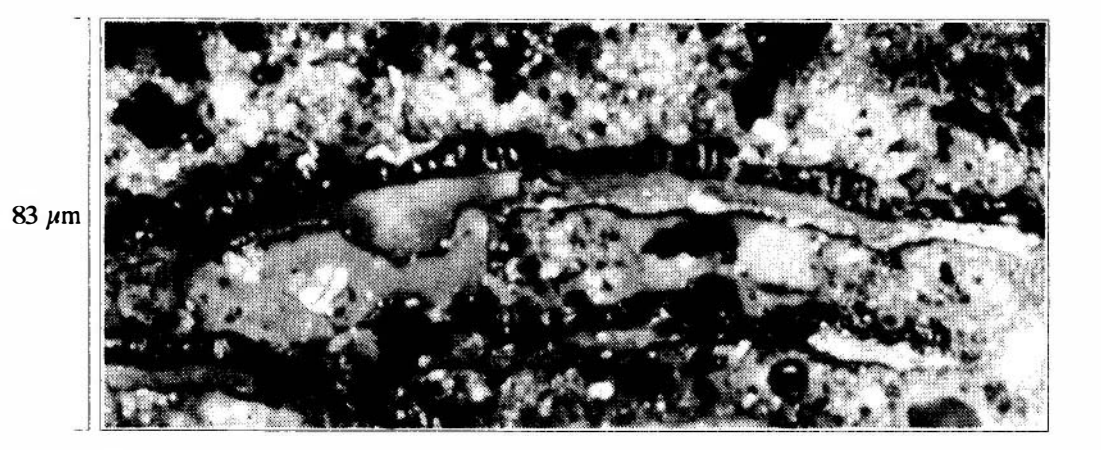
Figure 5 Rice hull relic in glassy matrix of fired refractory.