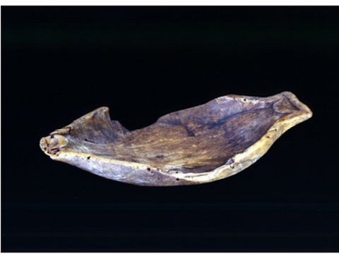
Figures 2 & 3: Am 1895,0717.12, 1.

this small wooden plank ( Fig. 2 ), later identified as one side from a wooden box, as well as an almost intact wooden bowl carefully carved with shark tooth implements ( Fig. 3 ).