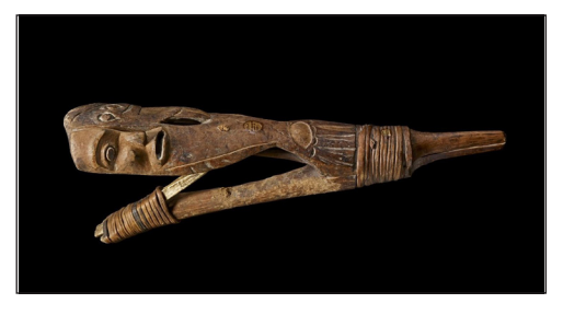
Figure 1: Am9820.

This theoretical study examines a number of objects from the British Museum's Floridian archaeological collection to attempt