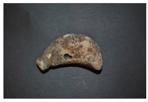
Figure 8: Am 1907,0614.89.

The tribes of the Northern part of the coast, in what is today Southern Alaska and British