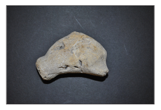
Figure 9: Am 1907,0614.90.