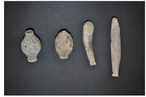
Figures 6 & 7: Am 1907,0614.64, 82, 94, 92, 81, 71, 61.