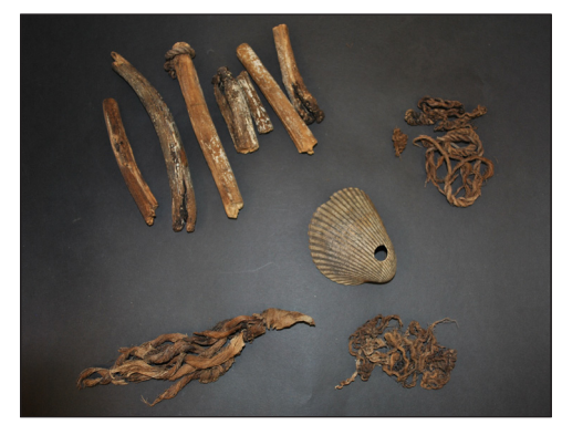
Figure 4: Am 1895,0717.2, 8, 9, 11.

These held that the original inhabitants of the region which became the Southern United States were inhabited by a mysterious civilisation to whom objects regarded as sophisticated or beautiful, such as those Durnford discovered, were attributed. These people were believed to have disappeared suddenly sometime pre-European contact (Durnford, 1895: 1032).