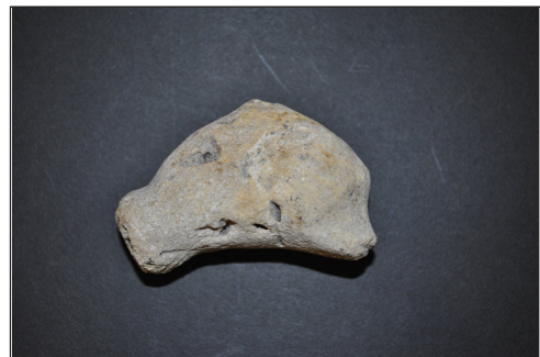
Figure 9: Am 1907,0614.90.