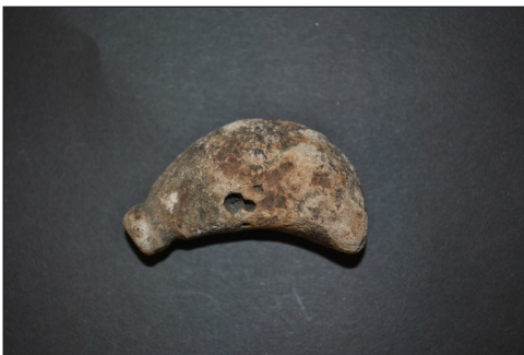
Figure 8: Am 1907,0614.89.

The tribes of the Northern part of the coast, in what is today Southern Alaska and British