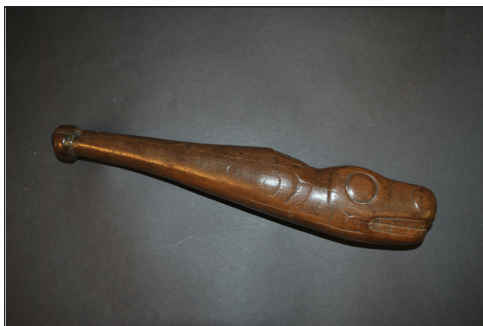
Figure 10: Am 1949,22.96.

The author is a Collaborative Doctoral Student, jointly supervised by the British Museum and University College London. Some contributory research for this paper was undertaken during previous employment with the British Museum.