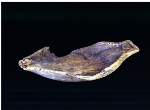
Figures 2 & 3: Am 1895,0717.12, 1.