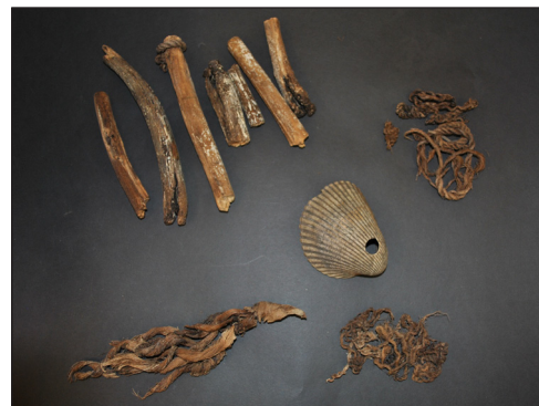
Figure 4: Am 1895,0717.2, 8, 9, 11.