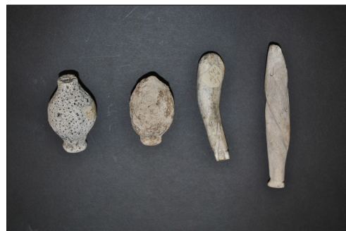
Figures 6 & 7: Am 1907,0614.64, 82, 94, 92, 81, 71, 61.