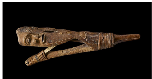
Figure 1: Am9820.

This theoretical study examines a number of objects from the British Museum’s Floridian archaeological collection to attempt