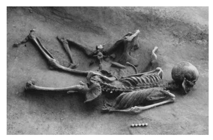
Figure 2. Colombara tomb 61 from Gazzo Veronese. Young woman buried face-down with a horse leg and a few animal bones (Salzani 2008)