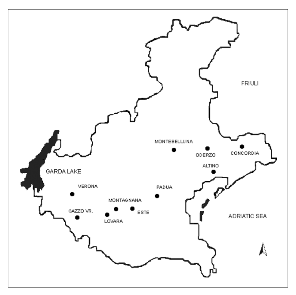
Figure 1. Map of the Veneto region.

Meyer 2002; Ogden 2001; Zeiten 2007). On the contrary, archaeologists still regard the study of magic and ritual in prehistory as highly problematic (e.g. Verhoeven 2002). As I show later, however, ethnographic examples demonstrate the connection between the practice of magic and attempts to deal with economical change, gain social recognition, and justify inequalities on an ideological level. Magic is often integrated into official religion and amulets, far from being 'minor' artefacts, must be considered the 'materialisation' of emotional experiences, religious practices and forms of gender, age and class negotiation which deeply affect the functioning of society as a whole.