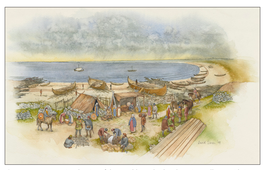
Figure 3: Reconstruction drawing of the possible market beach at Pierowall. © David Simon.

Cooke: Trading Identities Art.1, page 7 of 15