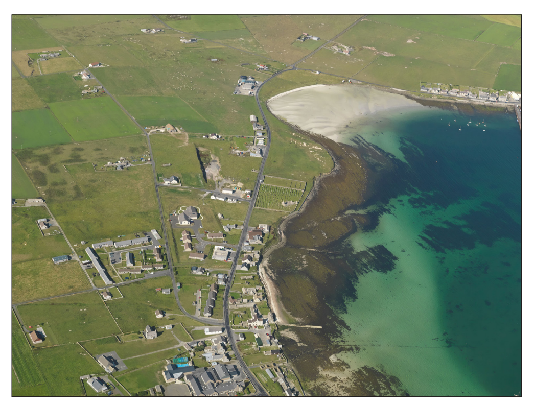
Figure 2: Aerial photograph of Sands of Gill and Pierowall village, Westray.

Art.1, page 6 of 15 Cooke: Trading Identities