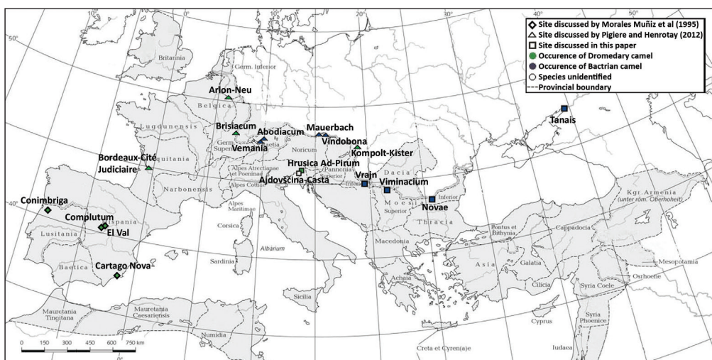
Figure 2: Sites where occurrence of camel remains and their species identification was confirmed (Modeled by Juszczak and Tomczyk on the basis of Verteilung der (33) Legionen im Römischen Reich (um. 200 n. Chr.) at Der Neue Pauly 7: 11, Brill Online, 2007).

My work does not exhaust the subject of occurrence and role of camels in the Empire. The new evidence for hybridization should be considered. This paper is only a starting point for further, more detailed studies, which could be possible with progress of zooarchaeological work on other sites. If more reports become available widely, more opportunities to study the problem of occurrence and spreading of camels will emerge. All the results of these future studies should be standardized; the differences of how information was obtained in various