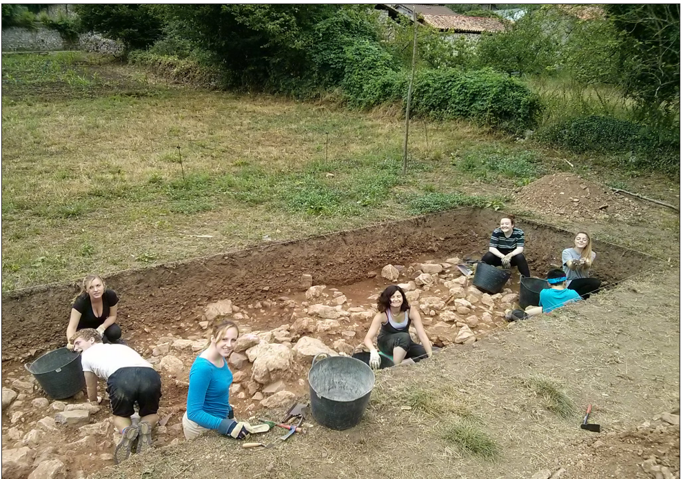
Figure 2: The excavation site showing the remains of buildings destroyed in the flash flood.

The majority of the ceramic remains are domestic cooking and storage vessels of various sizes with rounded bodies and flanged rims, made with a slow-wheel technology, alongside a small quantity of handmade vessels. The forms, fabrics and incised decorations of the vessels are typical of the late medieval period in the area. The sizes of the pottery fragments and their degree of roundedness is consistent with samples taken from contemporary open fields in the area that have been under plough. Comparing these contemporary examples with larger, less rounded samples taken from land worked with hand-tools indicates that the medieval agricultural layers were probably under cultivation that included the use of ploughs.