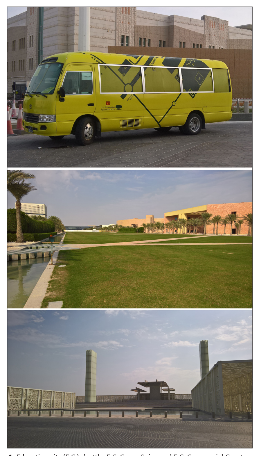
Figure 1: Education city (E.C.) shuttle, E.C. Green Spine and E.C. Ceremonial Court.