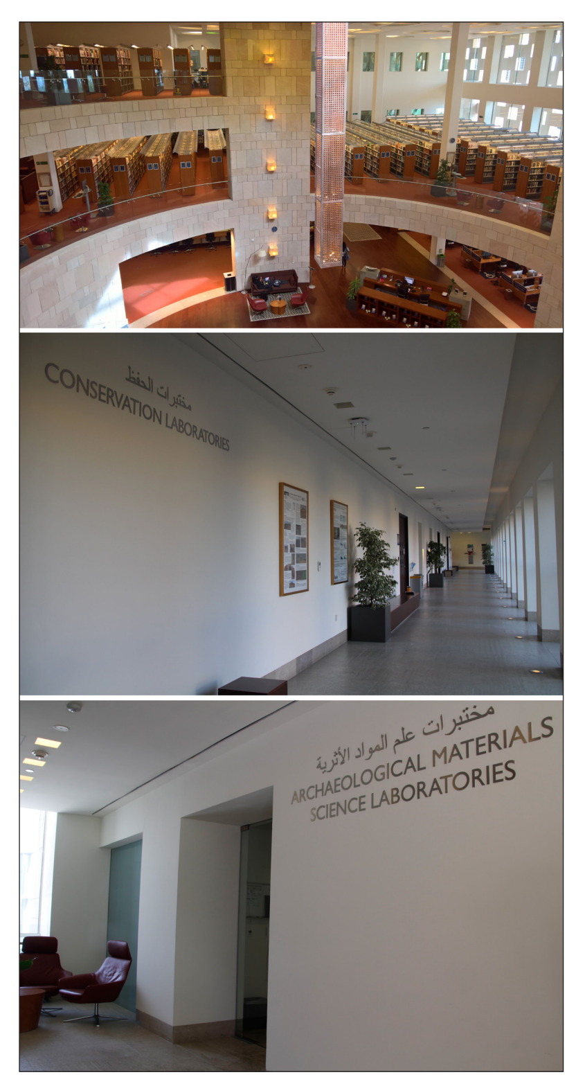
Figure 3: UCL-Q Library, UCL-Q Conservation Labs and UCL-Q Archaeological Materials Labs.