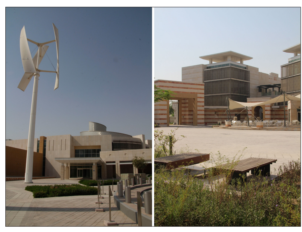
Figure 2: Education city Accommodation.

range from movie nights (complete with popcorn and pizza) to health and fitness classes.