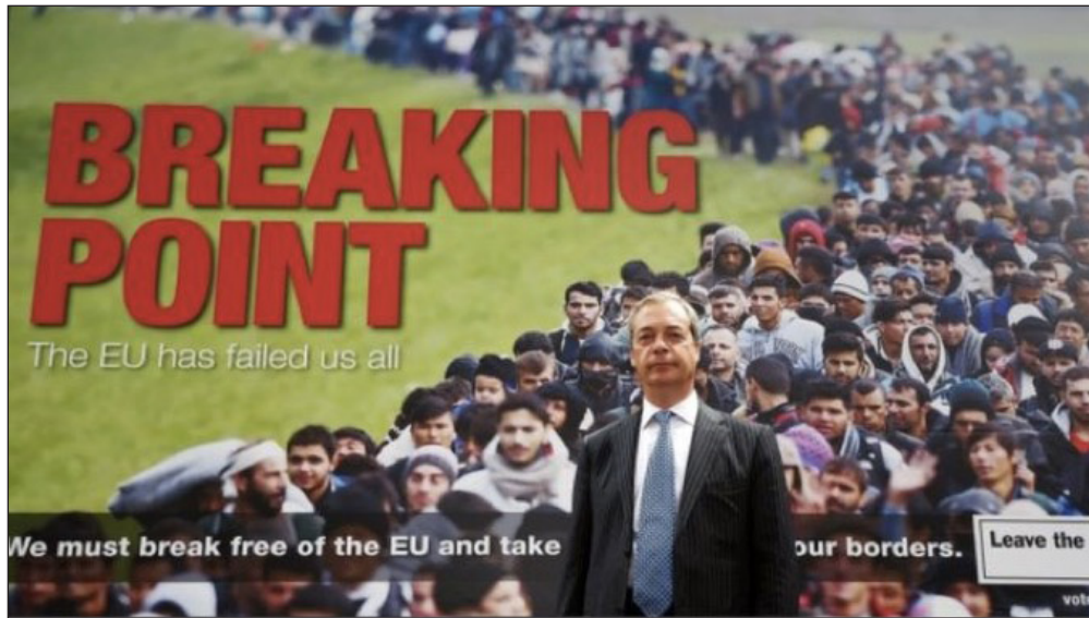
Figure 3: Nigel Farage and his much criticised 'Breaking Point' anti-EU poster, which shows a long queue of migrants (BBC news).

of Leave voters will feel the social impact of Brexit in a more minimal way than culturally diverse areas that were more likely to vote Remain. For example, in my own borough of Camden where 58% of the residents are non-UK natives, 75% of people opted to vote Remain (Arnot 2017).