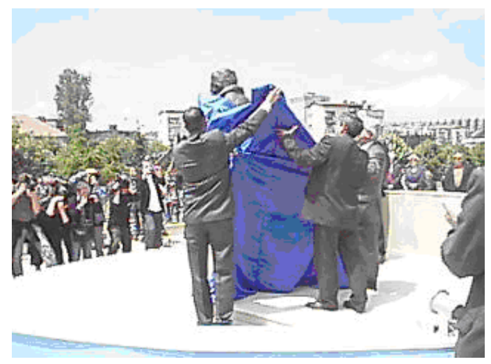
Figure 4. Unveiling a statue of one of the leaders of the pacific resistance movement in front of Pristina University.

the 2004 acts of destruction. However, behind the rosy view of 'universal heritage value' are tales of exclusion and a myriad of subversive accounts of heritage. Despite the emphasis on universal values, a cultural-historical emphasis on traditional, authenticity-based values and thus an evolutionary perspective, favours narratives of cultural