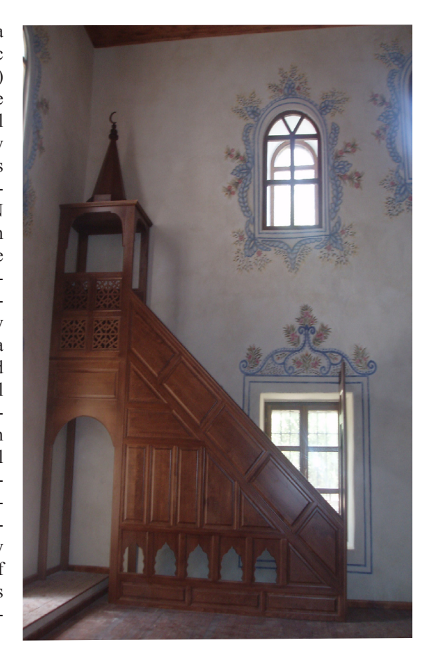
Figure 1. Restored interior of a mosque gutted in the 1998-99 conflict.

Bordering Montenegro, Albania and Former Yugoslav Republic of Macedonia, Kosovo (Serbian) or Kosova (Albanian) is the subject of ongoing territorial dispute. Although technically part of Serbia, the province has been an international protectorate of the United Nations (UN Security Council Resolution 1244) since June 1999. The systematic targeting of the heritage of the 'other' in former Yugoslavia has been described by scholars as the suppression of a "culturally diverse and hybrid past, in favour of a mythical golden age of ethnic uniformity" (Hall 1998, cited in Bevan 2006:6). The Director-General of the United Nations Educational Scientific Cultural Organisation (UNESCO), Koïchiro Maatsura, having already stated that the destruction of the Bamiyan Buddhas was a "crime against culture" (Reuters 12th March 2001) further emphasised the link between built heritage and identity in his statement on the 2004 wave