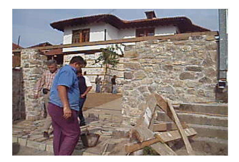
Figure 3. Cultural Heritage without Border's restoration of an Ottoman Town House in a Serbian Village 2006.

The use of interpreters, when needed, was part of the process and I deliberately attempted to include them both during and after, asking for their thoughts and views of the interview. Over the month, previous interviews began to inform later ones as I increasingly asked interviewees to comment on information I had gathered. I also de-