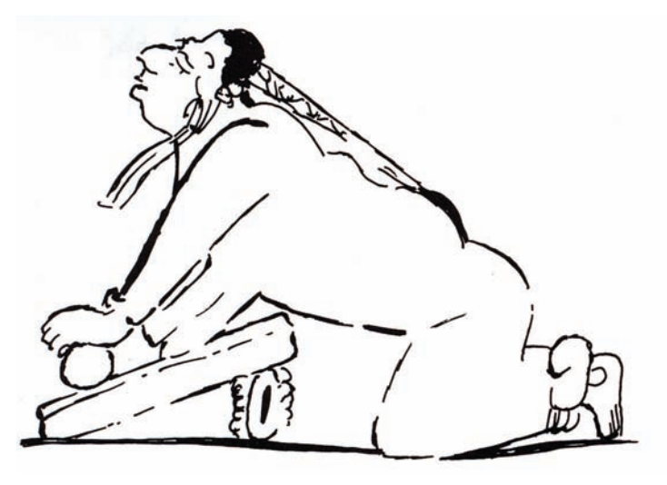
Figure 1. Woman grinding maize on vessel K631 (Source: Houston et al. 2006: 111. Courtesy of the University of Texas Press and the authors).

In conclusion, although every line of evidence has its weaknesses, the employment of several of them at the same time should reduce the risk of producing an a priori construction of the past. For example, the quasi-universal assumption that women are in charge of food and textile production seems confirmed for the Maya by ethnographic, ethnohistorical (Vail and Stone 2002: 218), archaeological (Joyce 1992, 1993) (Fig. 1) and osteological analysis (Wanner et al. 2007). It is probable, therefore, that Maya women were indeed involved in such activities.