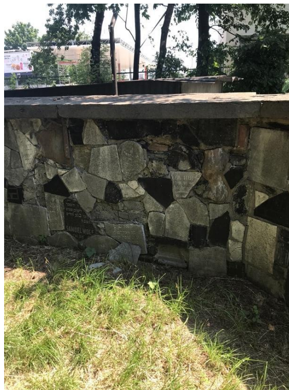
Figure 10: The cemetery wall made of Jewish gravestones