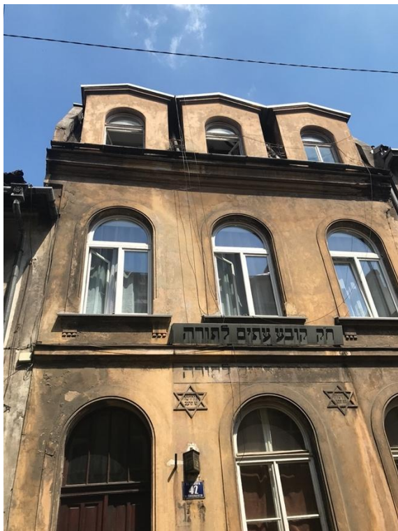
Figure 1: The well-preserved High Synagogue, currently a site for exhibitions and other cultural events