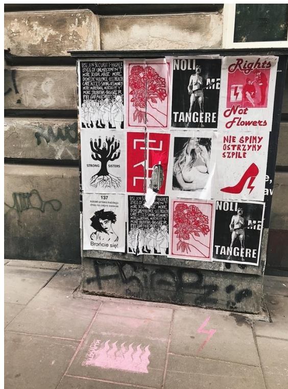
Figure 6: A pro-women's rights posters of the Jewish Culture Festival