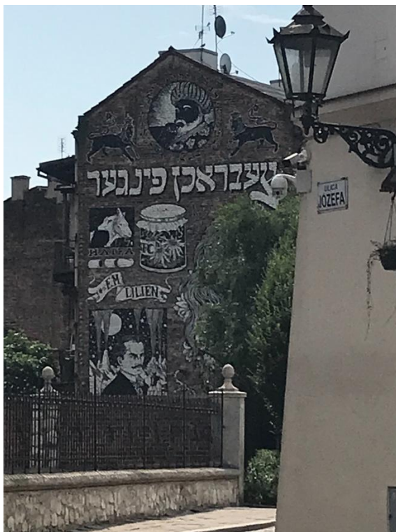
Figure 4: A Jewish-themed mural on a house that formerly belonged to a Jewish family, with the aim to accentuate the Jewish identity of the neighbourhood