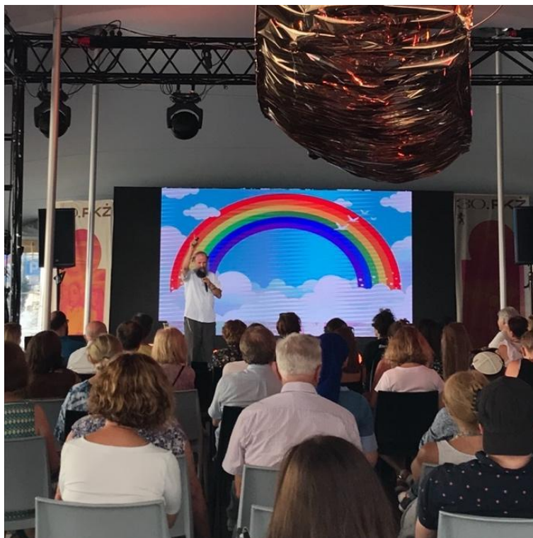
Figure 7: A rabbi delivering a lecture on the symbolism of a rainbow during the Jewish Culture Festival

The Jewish character of Kazimierz represents concerns that extend far beyond the theme of Jewishness in itself. This is revealed by analysing the history of the quarter's revitalisation and present engagement with its heritage. As Macdonald suggests, 'difficult heritage' often serves as a 'moral compass' for post-conflict communities, reflecting the direction they wish to take and figuring as a metaphor for their new identity. 35 Kazimierz, the material reminder of an oppressed minority, historically came to represent minority interests generally, becoming a counter-space to dominant narratives. Lehrer identifies such heritage as 'minority heritage', describing it as a space that can make alternative identities more accessible. 36