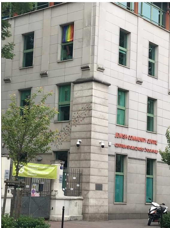
Figure 5: A pro-LGBT+ rainbow flag in the window of the Jewish Community Centre