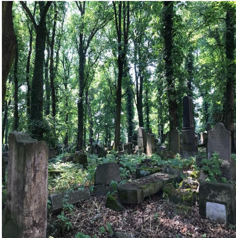
Figure 8: The New Jewish Cemetery in its neglected state