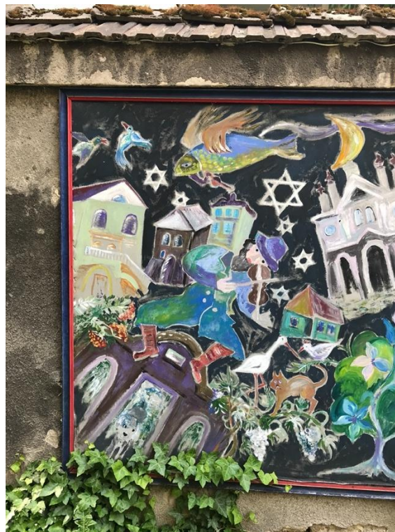
Figure 2: A pro-Jewish mural in Kazimierz, depicting the Jew as an integral element of the city landscape