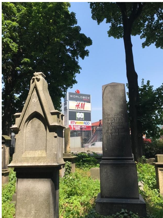
Figure 9: The view from the cemetery on the neighbouring shopping centre