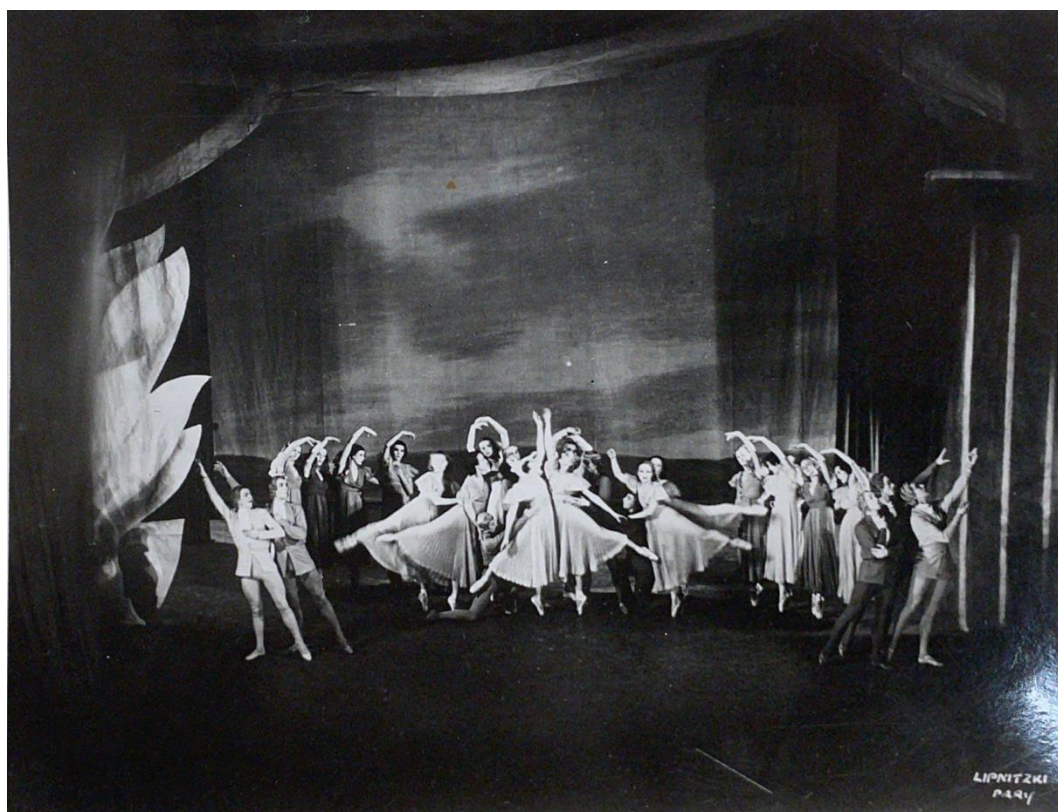
Figure 3: Dancers in the concluding scene of Chopin Concerto , Lipnitzki Photographs, Paris, 1937, Nijinska Archives, LOC.

As such, Niżyńska's final image of Chopin Concerto uses the dancers' bodies to attain a rich timbre of choreographed grace and beauty as they interlock and complement each other. Niżyńska expands on the imagery of Romantic ballets and extends the principles of Romantic music and literature, which loom large in Poland's cultural memory, to demonstrate the capability of modern Poland's dancers. Yet, Chopin Concerto also displays Niżyńska's use of ballet to explore the revival of Romanticism's legacy, refashioned to vocalise the artistic culture of an independent, burgeoning Poland.