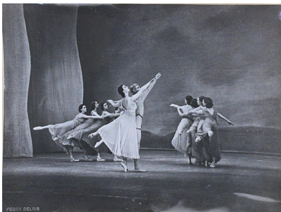
Figure 2: Soloists and corps de ballet in arabesque arrangement, Chopin Concerto , Peggy Delius Photographs, London, 1937, Nijinska Archives, LOC.

Youshkevich recalled that the soloists' numbers was reflective of the melodious action of the music, as the dancing 'was like two answering voices very much in the music. You can hear one voice coming in then another voice'. 42 The soloists were crucial to the interweaving of the choreography with Chopin's music, as evidenced by their separate positioning onstage. Niżyńska's choreographic notes and photos from rehearsals and performances reveal that the two female soloists remained visually distinct from the corps de ballet. Considering their sing-song choreographic interaction, Niżyńska's separation of the soloists from the corps can be interpreted as an embodiment of the musical melody floating above the harmony's rich texture.