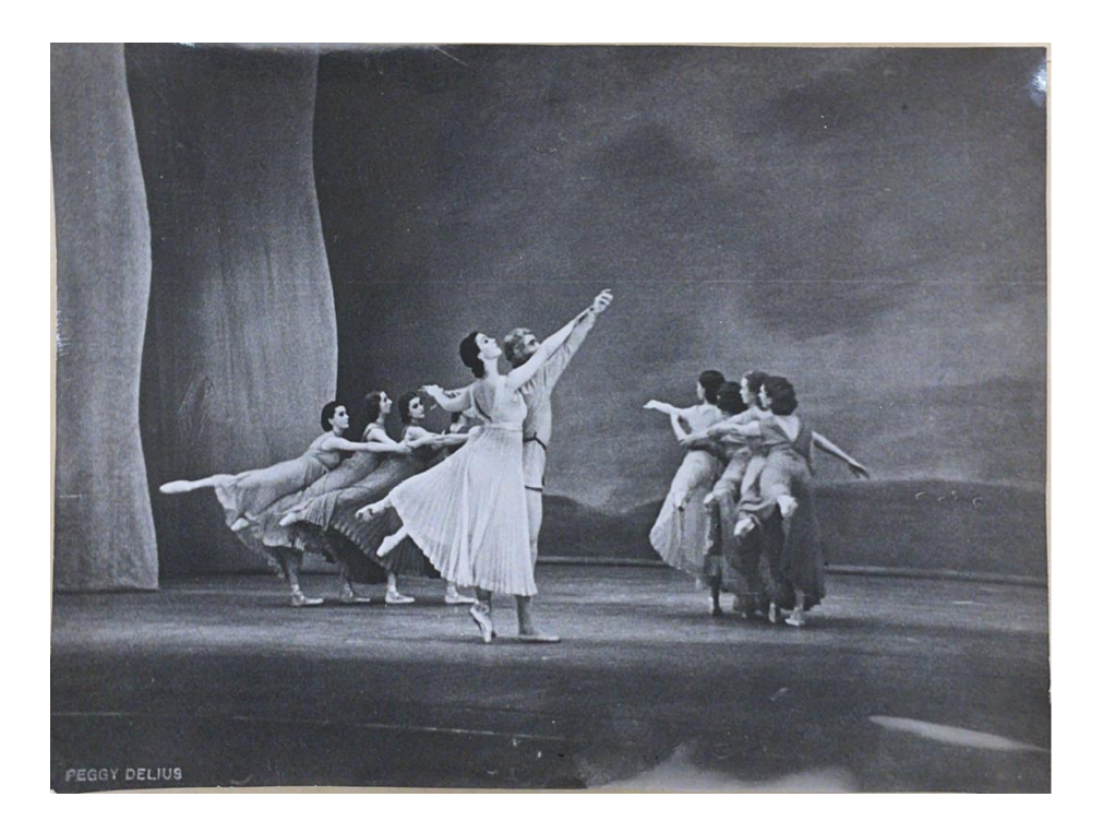
Figure 2: Soloists and corps de ballet in arabesque arrangement, Chopin Concerto , Peggy Delius Photographs, London, 1937, Nijinska Archives, LOC.

Youshkevich recalled that the soloists' numbers was reflective of the melodious action of the music, as the dancing 'was like two answering voices very much in the music. You can hear one voice coming in then another voice'. 42 The soloists were crucial to the interweaving of the choreography with Chopin's music, as evidenced by their separate positioning onstage. Niżyńska's choreographic notes and photos from rehearsals and performances reveal that the two female soloists remained visually distinct from the corps de ballet. Considering their singsong choreographic interaction, Niżyńska's separation of the soloists from the corps can be interpreted as an embodiment of the musical melody floating above the harmony's rich texture.