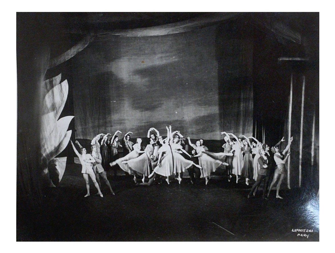
Figure 3: Dancers in the concluding scene of Chopin Concerto , Lipnitzki Photographs, Paris, 1937, Nijinska Archives, LOC.

As such, Niżyńska's final image of Chopin Concerto uses the dancers' bodies to attain a rich timbre of choreographed grace and beauty as they interlock and complement each other. Niżyńska expands on the imagery of Romantic ballets and extends the principles of Romantic music and literature, which loom large in Poland's cultural memory, to demonstrate the capability of modern Poland's dancers. Yet, Chopin Concerto also displays Niżyńska's use of ballet to explore the revival of Romanticism's legacy, refashioned to vocalise the artistic culture of an independent, burgeoning Poland.